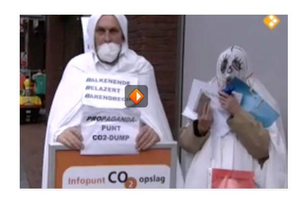
Barendrecht residents say NO to CO2 storage