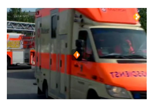
Ambulances come to the rescue after a CO2 release in Germany