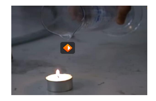
Pour CO2 over a candle and the oxygen will disappear